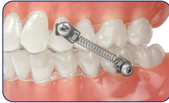
Low Force Spring Delivers 150 Grams Of Force